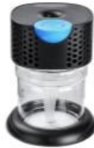
Air Care 3 Go